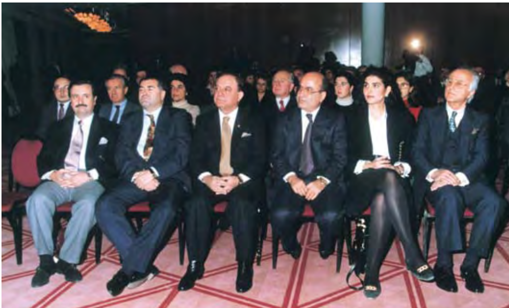
The meeting on our 10th Anniversary with the participation of Ministers and Founders.