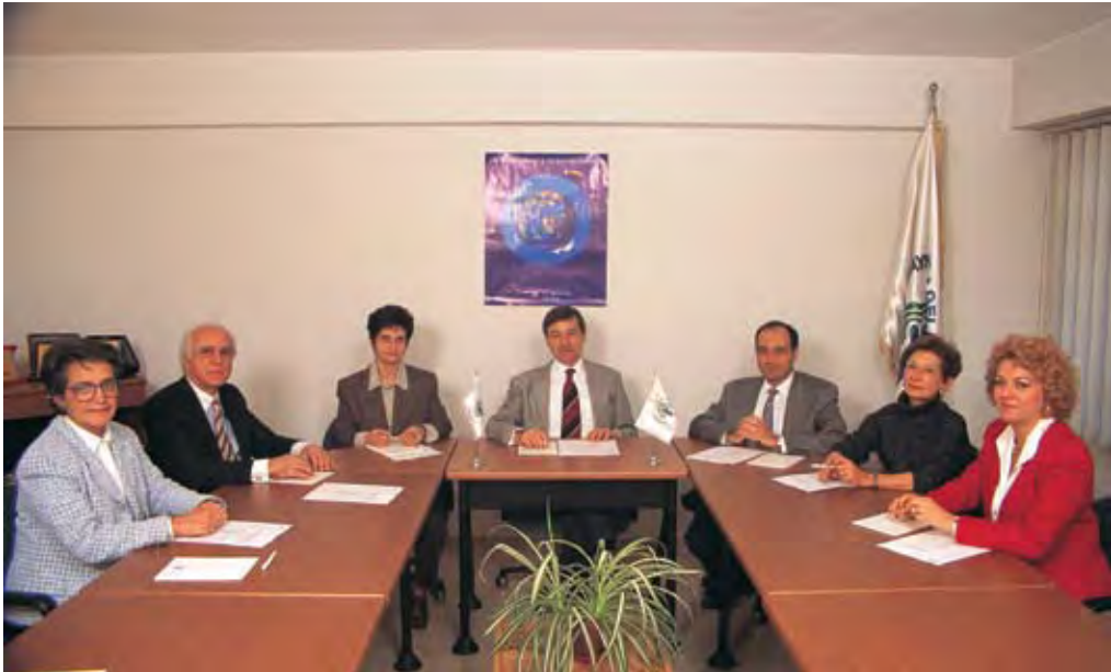
A memoir from previous Executive Board meetings during the first years.