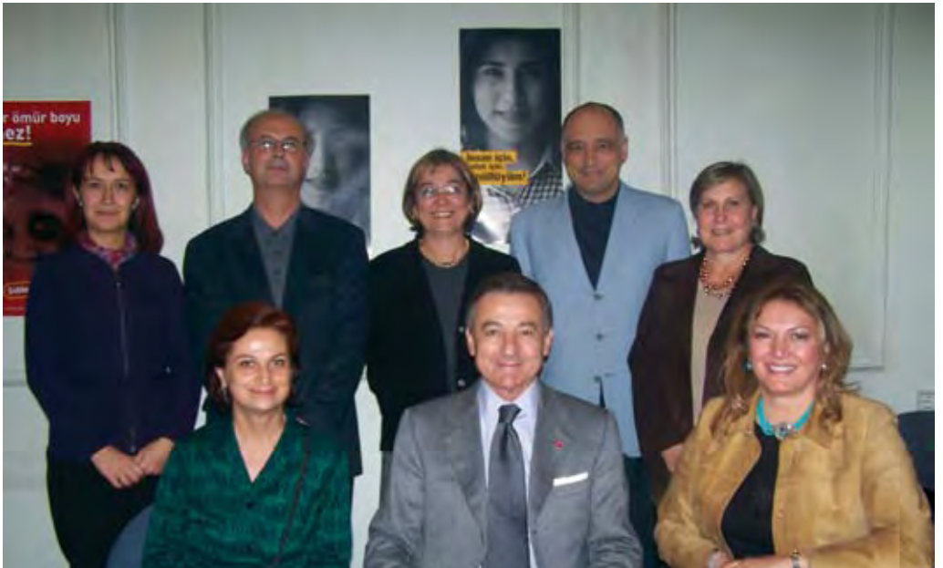
Another memoir from an Executive Board meeting.